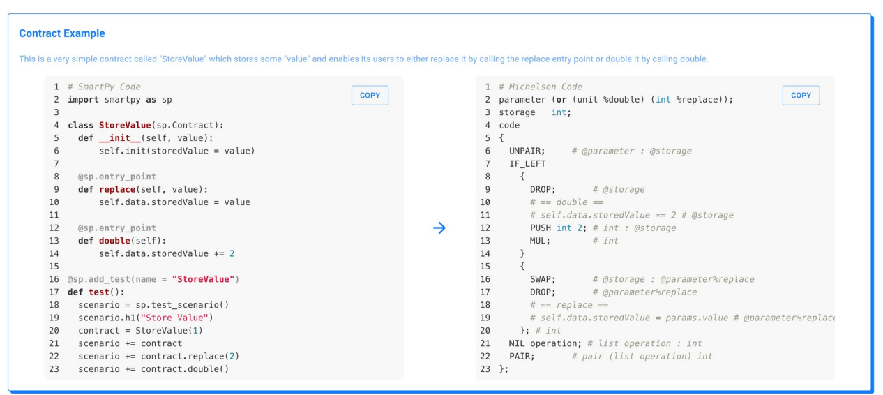
Figure 1: A comparison of a simple smart contract in Python (left) and Michelson (right)<sup>13</sup>

An organization called Smart Chain Arena has created a Python<sup>11</sup> library called SmartPy<sup>12</sup> that is tailored specifically for developing smart contracts. For anyone even moderately versed in Python, SmartPy is immediately accessible, particularly as compared to the code needed to actually execute on the Tezos platform (see Figure 1).